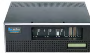
Commander Site Controller