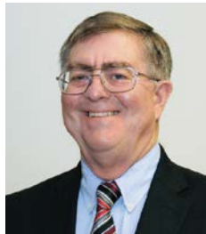
By Roy Littlefield III

Joining with 7 other national associations representing the automotive aftermarket, SSDA-AT has written to the Senates Appropriations Committee regarding the telematics report language in the FY2021 THUD appropriations legislation (see next page for letter).