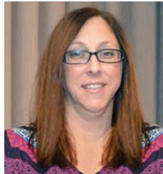
By Sandi Weaver BA Auto Care, Inc.

I write articles for a very small local publication each month and last month I wrote about extended warranties. I listed the pros and cons of purchasing one and the variety and difference in coverage between companies. Having dealt with these companies on behalf of our customers for years, I have a very low opinion of them. They don't cover all repairs/systems, they don't cover the complete cost and they cost a fair bit of money up front. I've always been of the mindset to save the money you'd spend on the extended warranty and use it whenever a large repair is needed. Well, I just recently purchased a new car and guess what? I bought the extended warranty.