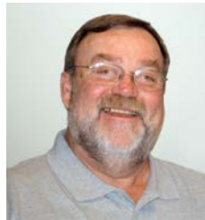
By Kirk McCauley, Director Of Member Relations & Government Affairs

Maryland Department of Environment releases new plan to reduce Green House Gas emission. You can go to the link and view entire plan by clicking on to Plan in second paragraph of news release. The plan still includes TCI as outlined on page 190 (249 Pages total) in this carbon manifesto.