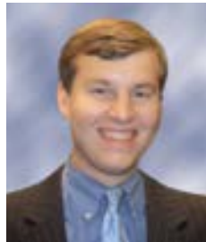
By Roy Littlefield IV

SSDA-AT continues to educate members of Congress on the Right to Repair as we look for more co-sponsors on the legislation that was introduced.