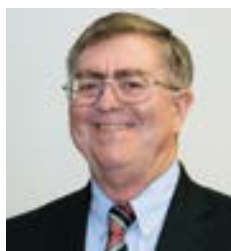
By Roy Littlefield III