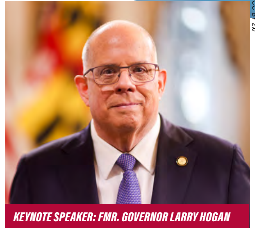
KEYNOTE SPEAKER: FMR. GOVERNOR LARRY HOGAN